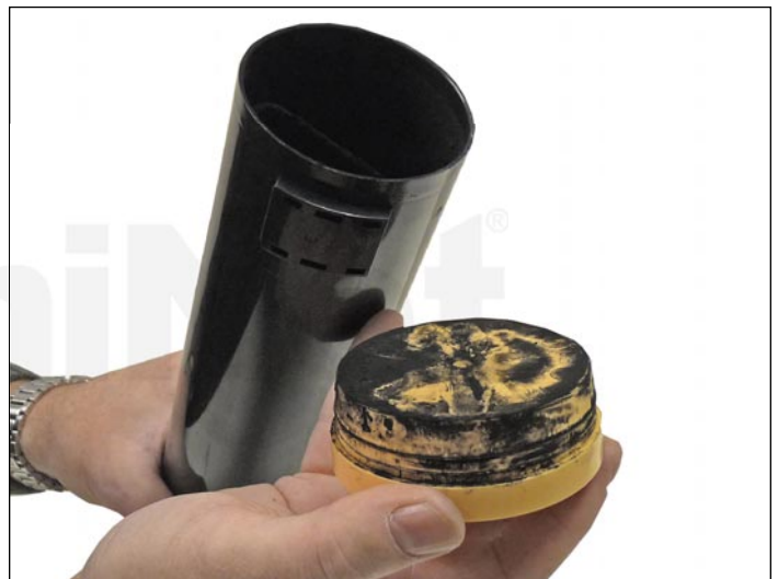
2. Remove the end cap.