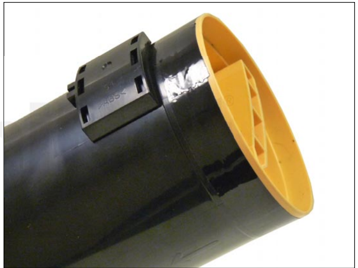
4. Replace the end cap. Replace the tape.