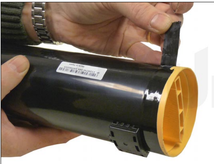
1. Remove the tape from the colored end cap.

The Phaser 7760 cartridges are rated for 32,000 pages Black and 25,000 Color. The OEM numbers are 106R01163 Black, 106R01160 Cyan, 106R01161 Magenta, and 106R01162 Yellow. There is a chip that must be replaced every cycle.