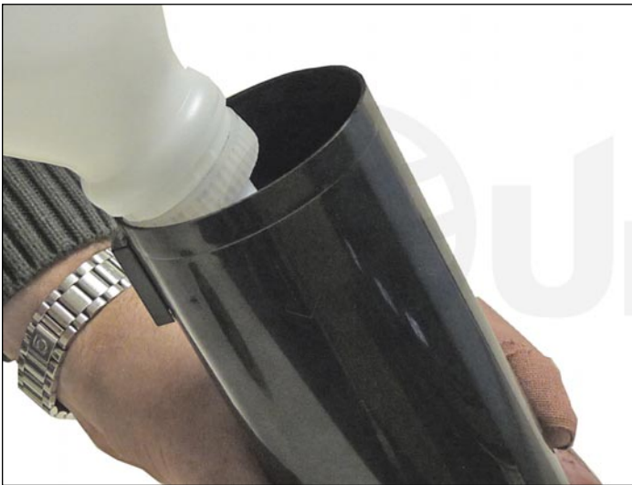
3. Vacuum the tube clean and fill with new toner for use in Phaser 7760.